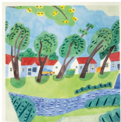
Lincoln and McLean, 2001, watercolor, 9" x 9.5"

As you walk around the exhibit, two feelings will predominate—“This is kinda familiar,” and “This is not quite familiar.” This is by design, an outgrowth of the artist’s recursive, evolutionary design process. From an initial, fairly realistic sketch comes a series of small watercolors during which the scene is broken down into shapes and patterns. In the course of these studies, the shapes and patterns are simplified and refined.