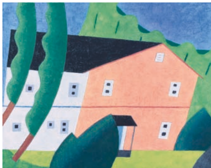
Hilltop, 2001, oil on board, 11" x 14"

the viewer from the colors and shapes. As a result, the eye is forced to roam and begins intuiting the complexities of the design. Shapes and colors repeat themselves and mirror themselves, or place themselves in relation to other elements. A cliché, but the more you look, the more you see. Patterns multiply, become part of other patterns, and soon you're aware of your eyes being pulled across the painting, almost as if being told where to look, and it's exhilarating. But it's also a trap. Once the painting has taught you how to read it, you do not forget. Ask yourself—is it sleight-of-hand, or is it magic?