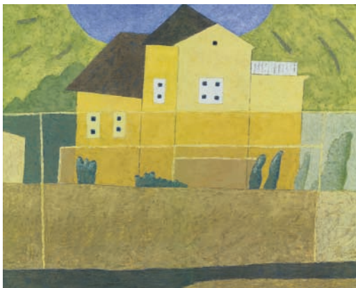
Fence , 2001, oil on board, 11" x 14"