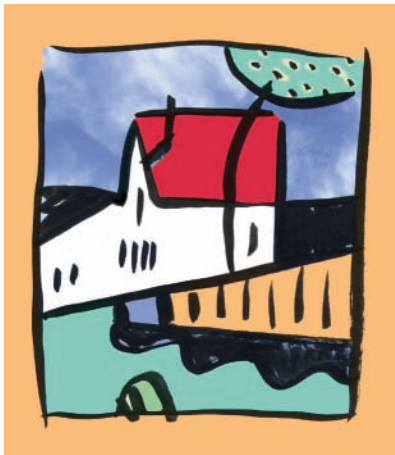
House that I see from Kellogg , 2001, laser print, 5" x 4"